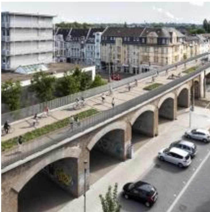
Bike Freeway, image of the anticipated end-state