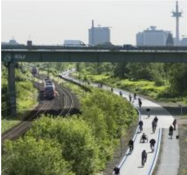
Bike Freeway, completed section