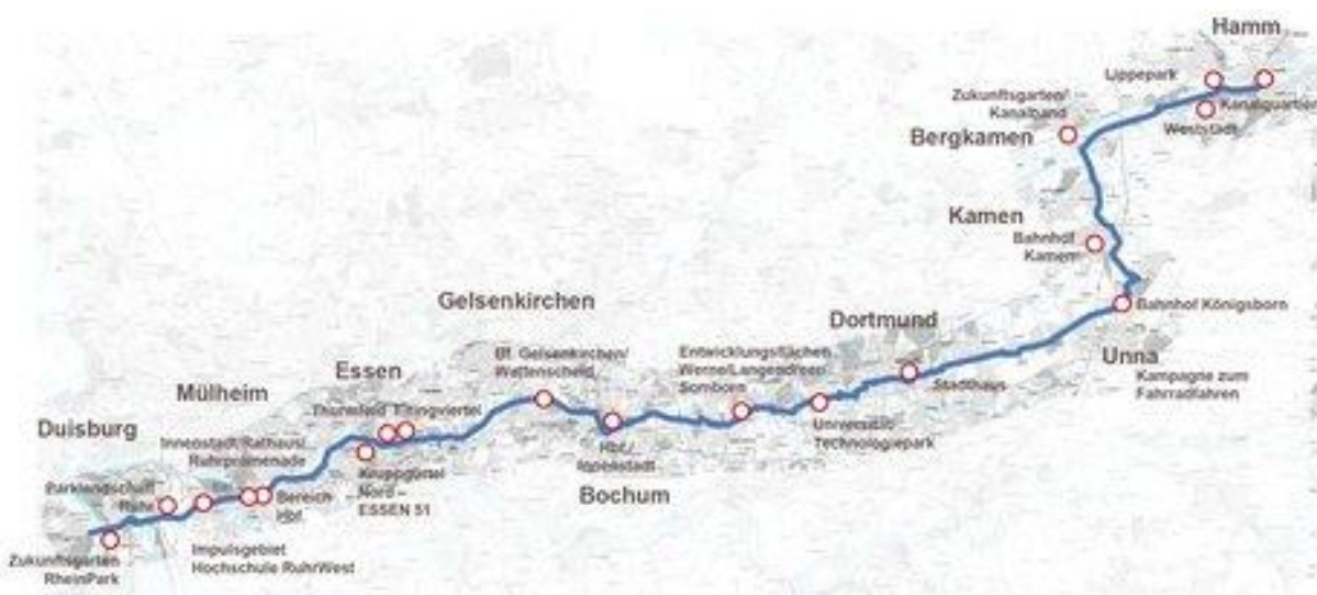
Bike Freeway, Ruhr Metropolitan Region, proposed alignment

At times, pilot projects may act as eye-openers for alternative ways of doing things. That's why I am showing you now such an on-going pilot project from my own region, the Ruhr Metropolitan Region in the western part of Germany. It is a freeway for cyclists of more than 100 kilometres, connecting the urban centres of the region. So far 15 kilometres of the track have been completed, and the freeway is already well patronised. It mainly follows former railway tracks. There is not a single traffic light, not a single level crossing. Cyclists can travel faster from their home to their workplace than commuters, who are using their car or those commuting by public transport. It is anticipated that once the freeway has been completed, it will have a marked impact on the modal split in favour of bicycle use.