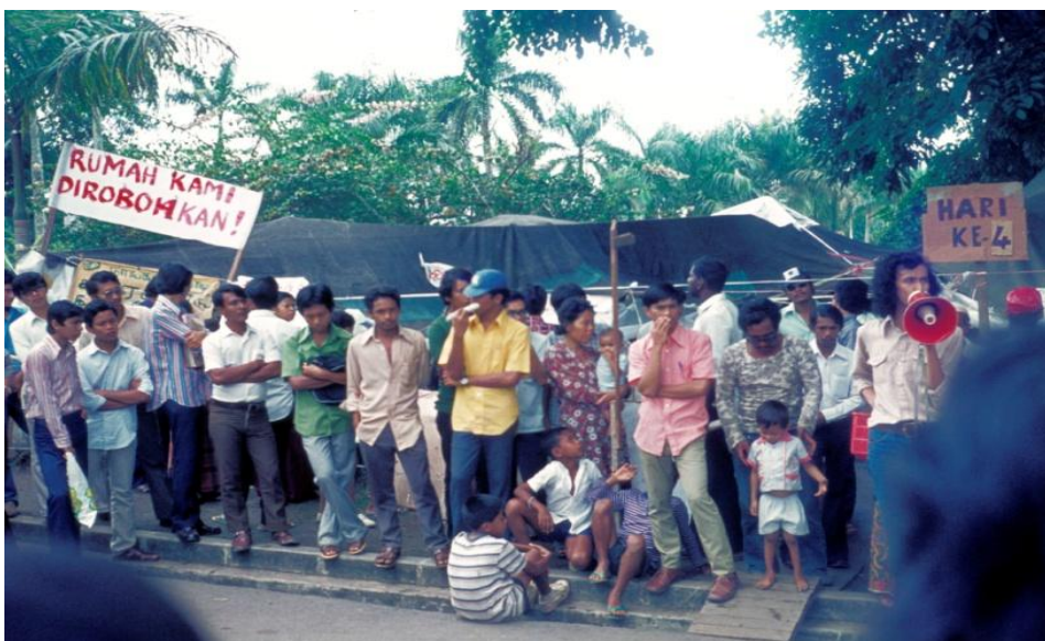
Demonstration of Tasek Utara squatters in Malaysia, 1974